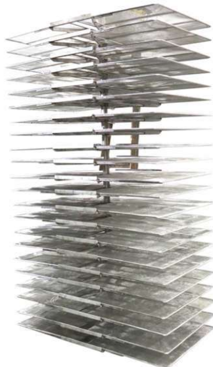
Stainless Steel Trolley Rack for Pet Food Cooking and Processing