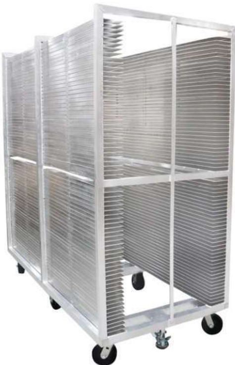
Aluminum Rack for Honeycomb Cardboard Support