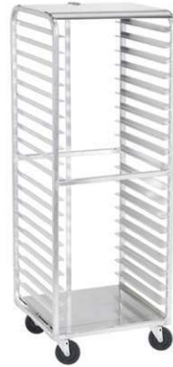
Donut Delivery Rack (for screens)