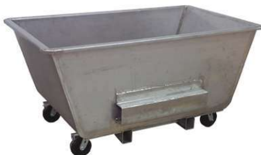
Stainless Steel Dough Trough