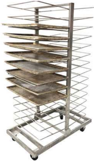
Stainless Steel Tree Rack