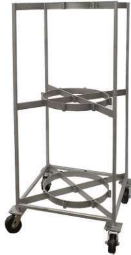
Stainless Steel Gyro Cone Holding Cart