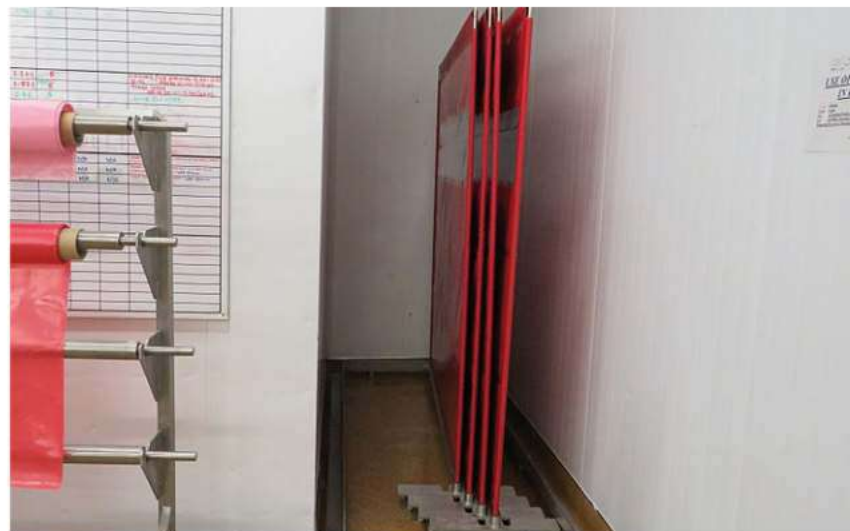
Wall sections nest when not in use