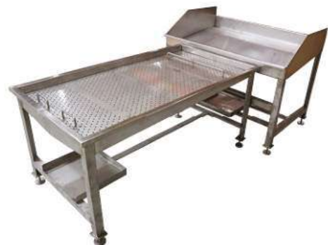
Stainless Steel Food Prep Table