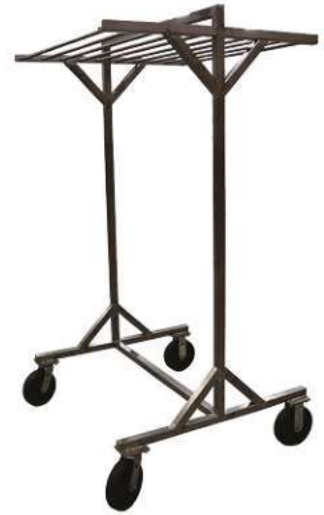
Stainless Steel Smokehouse Rack