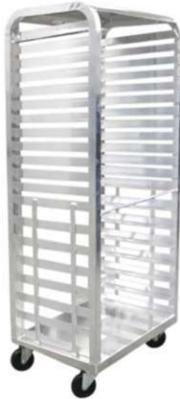
CDBR(20) Donut Delivery Rack (for baskets)