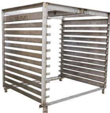
Stainless Steel Sous Vide Cook Rack