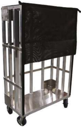
Airline Catering Food Transport Cart