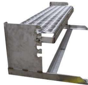
Stainless Steel Adjustable Step Support Cook Rack